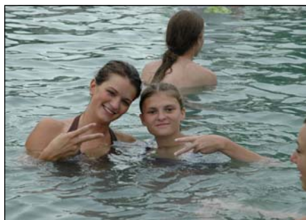
1 Corinthians 12:4-7

Camp Friedenswald is one of these settings in which we can try new things. We can replace the usual with the unusual. Whether you are a camp counselor, summer camper, or summer volunteer you can take part in new ways, gain experiences and learn lessons that will not soon be forgotten. Come and join us in the Peaceful Woods!